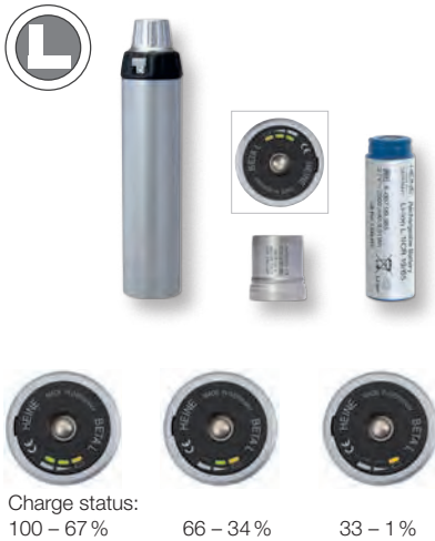
Charge status: 100 – 67% 66 – 34% 33 – 1%